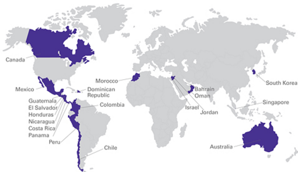
Countries with U.S. FTAs

https://smallbusiness.fedex.com/international/free-trade-agreement.html